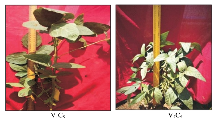
Plate 1: Plant height at 60 DAS in JS-335 and JS-9560.

The plant height (cm) at harvest differed significantly among the seed rate compensation levels and varieties. Among the varieties JS - 335 recorded the highest plant height at harvest (43.11cm) and the lowest (39.70 cm) was observed in JS – 9560. Among the seed rate compensation C1 recorded the highest plant height at harvest (43.11cm) and the lowest was seen in aged seeds of 50 per cent germination with compensated seed rate, 87.5 kg/ha (C5: 35.55 cm). Among the interaction, V_1C_1 recorded the highest plant height at harvest (47.48 cm) followed by V_2C_1 and V_1C_2 (44.37cm and 44.00 cm) and the lowest plant height at harvest was observed in V_2C_5 (32.29 cm) followed by V_1C_5 (38.81cm) and are presented in Table 2 and Fig. 1.